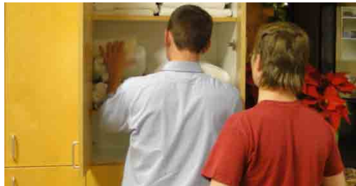
Family Junction residents learn life skills such as doing laundry.