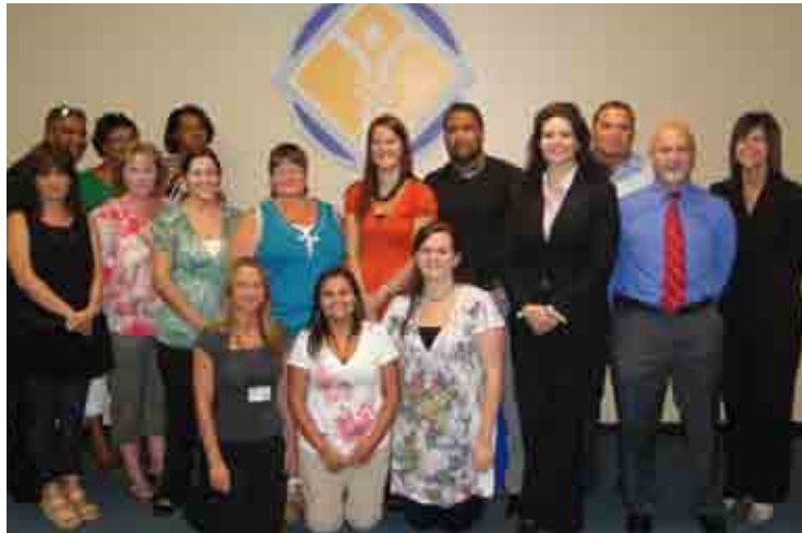
The Juvenile Re-entry of Oklahoma County (J-ROC) Program held an award ceremony for youth who have successfully re-integrated into the community after incarceration. Shown in the photo are J-ROC program partners from the Oklahoma Office of Juvenile Affairs.

Outpatient Behavioral Health Services provided 11,489 counseling hours to 353 clients and their family members in FY 2011. Our counseling center is internationally accredited and provides assessment, crisis intervention, mentoring, and re-integration services, life skills training, and individual, family and group counseling to at-risk youth and families.