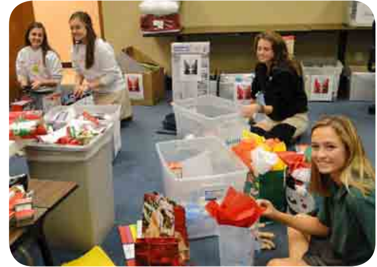
YSOC Teen Service Board Members wrap Christmas gifts they raised money and shopped for to give to SKIL teens.

SEP presented 9,542 hours of service to 500 youth and at least one of their parents during FY 2011. A court-ordered consequence for first-time youthful offenders and an optional program for families in crisis, parents and youth between the ages of 8 and 17 attend this four-week course together. Available in English and Spanish, classes teach conflict resolution, positive communication, and problem-solving skills for parent and child.